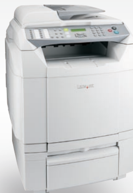
Model shown: Lexmark X502n plus second drawer